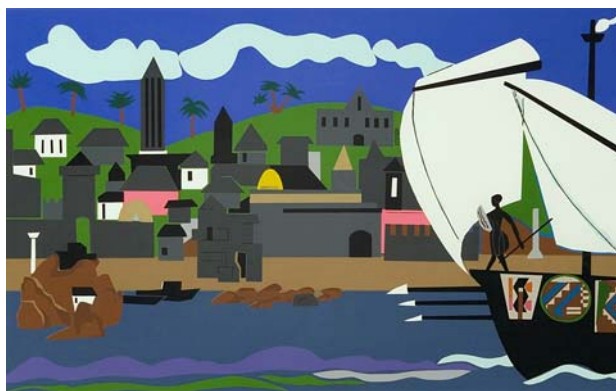
Home to Ithaca (Odysseus Series)

The exhibition was organized by The Romare Bearden Foundation, New York, NY Exhibition Tour Organization and Management by Landau Traveling Exhibition, Los Angeles, CA.